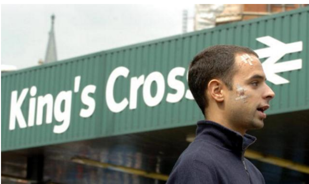
London 7/7 2005