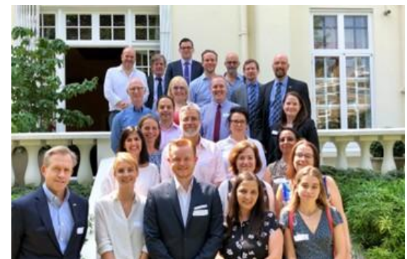
Learnings, looking ahead